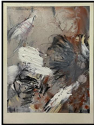
Title: Rindu Bayangan Size: 64cm x 49cm Medium: Oil on Canvas Year: 2021 Price: RM800