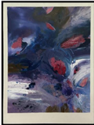
Title: Gelora Rindu Size: 64cm x 49cm Medium: Oil on Canvas Year: 2021 Price: RM800