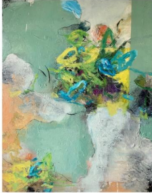
Title : Menggarap Purnama Medium : Oil on canvas Size : 152 x 122 cm Year : 2021 Price : MYR 4,400.00