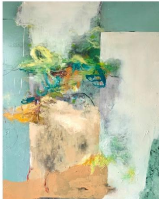
Title : Berlarian di Kaki Bukit Medium : Oil on canvas Size : 152 x 122 cm Year : 2021 Price : MYR 4,400.00