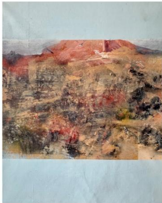
Title : Bertemu Laila i Medium : Oil on canvas Size : 70 x 56 cm Year : 2021 Price : MYR 1,000.00