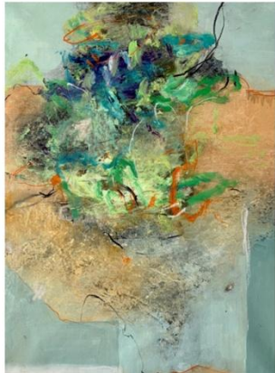
Title : Cerita Tentang Angin i Medium : Oil on canvas Size : 70 x 52 cm Year : 2021 Price : MYR 1,000.00