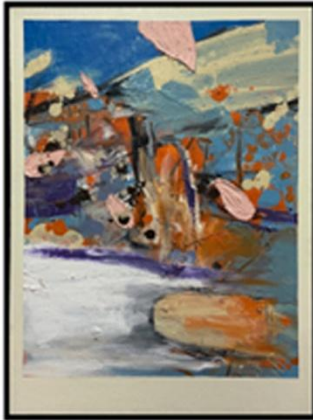
Title: Suria Pagi Size: 64cm x 49cm Medium: Oil on Canvas Year: 2021 Price: RM800