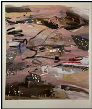
Title: Sebelum mekar Size: 110cm x 94cm Medium: Oil on Canvas Year: 2021 Price: RM2100