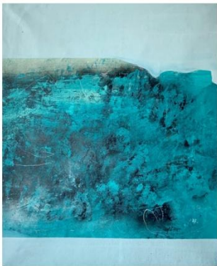
Title : Bertemu Laila ii Medium : Oil on canvas Size : 70 x 56 cm Year : 2021 Price : MYR 1,000.00