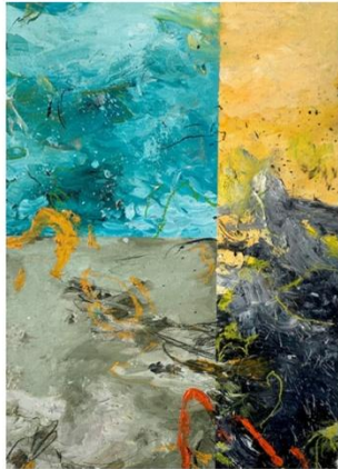
Title : Rindu Berbuah Lara Medium : Oil on canvas Size : 67 x 48 cm Year : 2021 Price : MYR 1,000.00