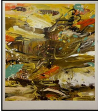
Title: Kini Mentari Terbit Lagi Size: 125.5cm x 110cm Medium: Oil on Canvas Year: 2021 Price: RM2800