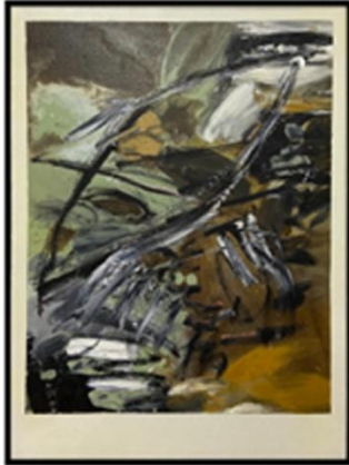
Title: Bayangan Semalam Size: 64cm x 49cm Medium: Oil on Canvas Year: 2021 Price: RM800