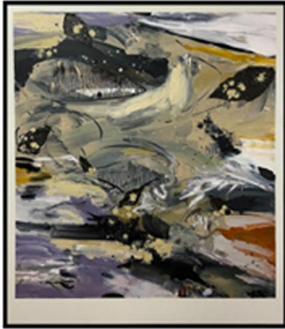
Title: Izinkan Kulukis Senja Size: 125.5cm x 110cm Medium: Oil on Canvas Year: 2021 Price: RM3600