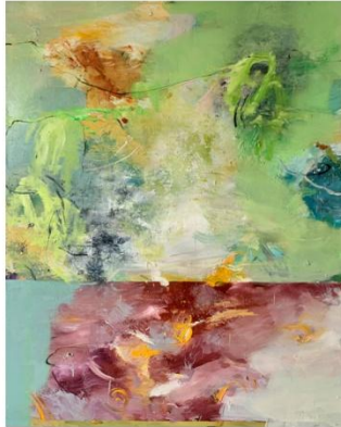
Title : Menunggu Matahari Senyum Medium : Oil on canvas Size : 152 x 122 cm Year : 2021 Price : MYR 4,400.00