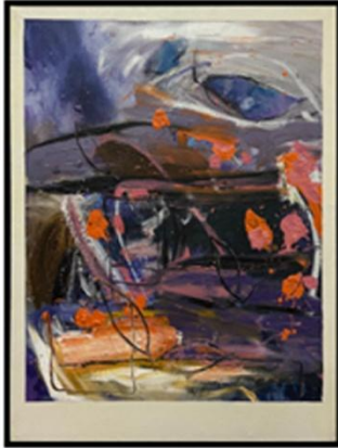
Title: Kusangka Mendung Size: 64cm x 49cm Medium: Oil on Canvas Year: 2021 Price: RM800