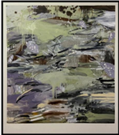
Title: Biarkan Kabus Pergi Size: 125.5cm x 110cm Medium: Oil on Canvas Year: 2021 Price: RM3600