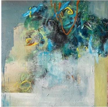
Title : Malam Tunggu Dulu Medium : Oil on canvas Size : 122 x 122 cm Year : 2021 Price : MYR 3,500.00