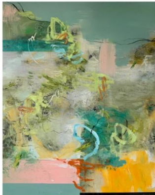
Title : Resah Medium : Oil on canvas Size : 152 x 122 cm Year : 2021 Price : MYR 4,400.00