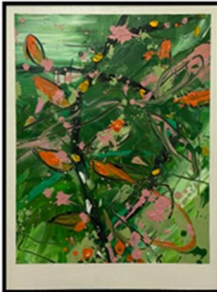
Title: Rimba Cintaku Size: 64cm x 49cm Medium: Oil on Canvas Year: 2021 Price: RM800