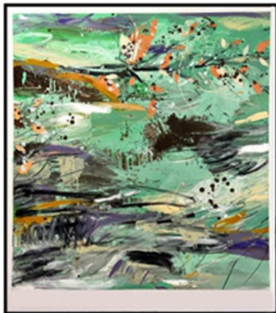
Title: Damai Terperi Kicau Bernyanyi Size: 156cm x 139cm Medium: Oil on Canvas Year: 2021 Price: RM4500