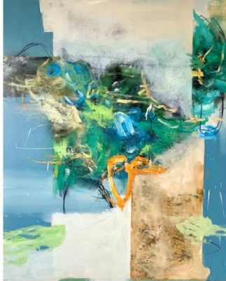
Title : Biar Pagi Datang Medium : Oil on canvas Size : 152 x 122 cm Year : 2021 Price : MYR 4,400.00