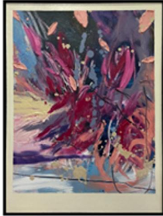
Title: Semanis Cinta Size: 64cm x 49cm Medium: Oil on Canvas Year: 2021 Price: RM800