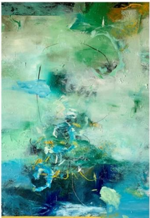
Title : Setelah Memanggil Terang Medium : Oil on canvas Size : 152 x 106 cm Year : 2021 Price : MYR 3,850.00