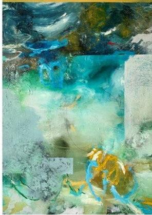
Title : Akhirnya Malam Tiba Juga Medium : Oil on canvas Size : 152 x 106 cm Year : 2021 Price : MYR 3,850.00