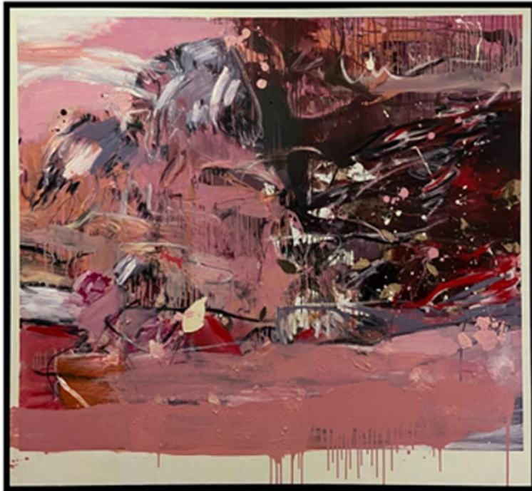
Title: Madah Berbunga Size: 170cm x 185.5cm Medium: Oil on Canvas Year: 2021 Price: RM6700