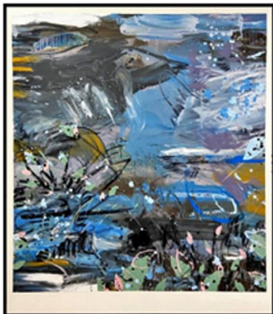
Title: Langit Cerah Barangkali Mengandung Hujan Size: 156cm x 139cm Medium: Oil on Canvas Year: 2021 Price: RM4500