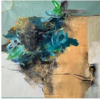
Title : Cerita Tentang Angin ii Medium : Oil on canvas Size : 66 x 66 cm Year : 2021 Price : MYR 1,000.00