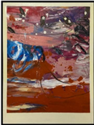
Title: Senja Manis Size: 64cm x 49cm Medium: Oil on Canvas Year: 2021 Price: RM800