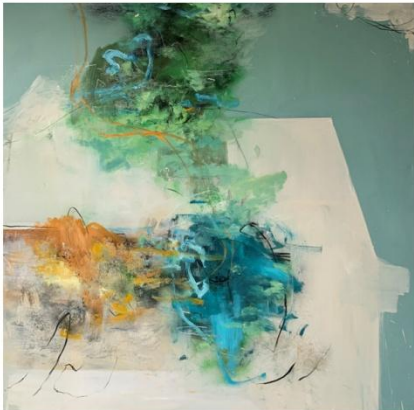
Title : Adapun ianya Mendung Seketika Medium : Oil on canvas Size : 152 x 152 cm Year : 2021 Price : MYR 5,500