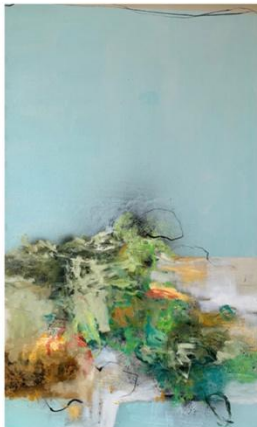
Title : Berantakan.. Medium : Oil on canvas Size : 152 x 91 cm Year : 2021 Price : MYR 3,350.00