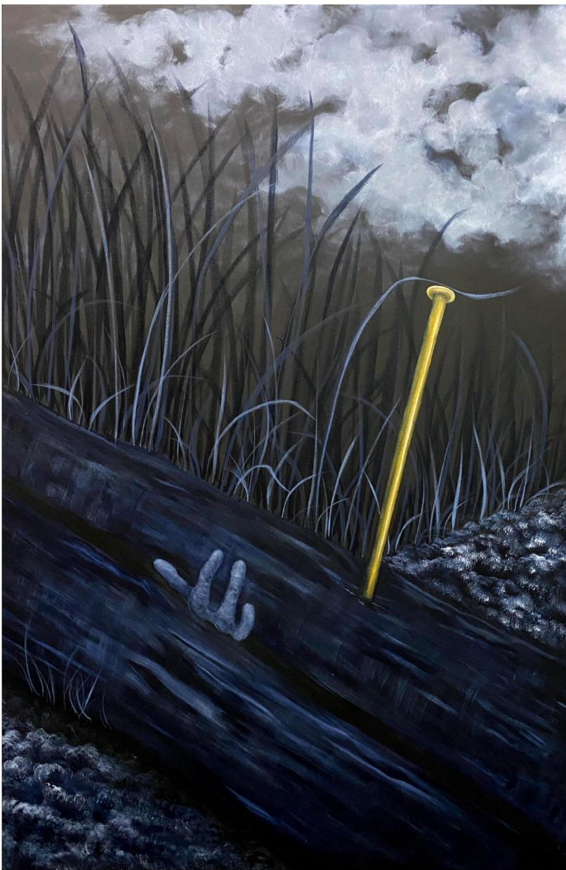
Last nail Acrylic on canvas 90 x 60 cm 2021 RM 1,200.00