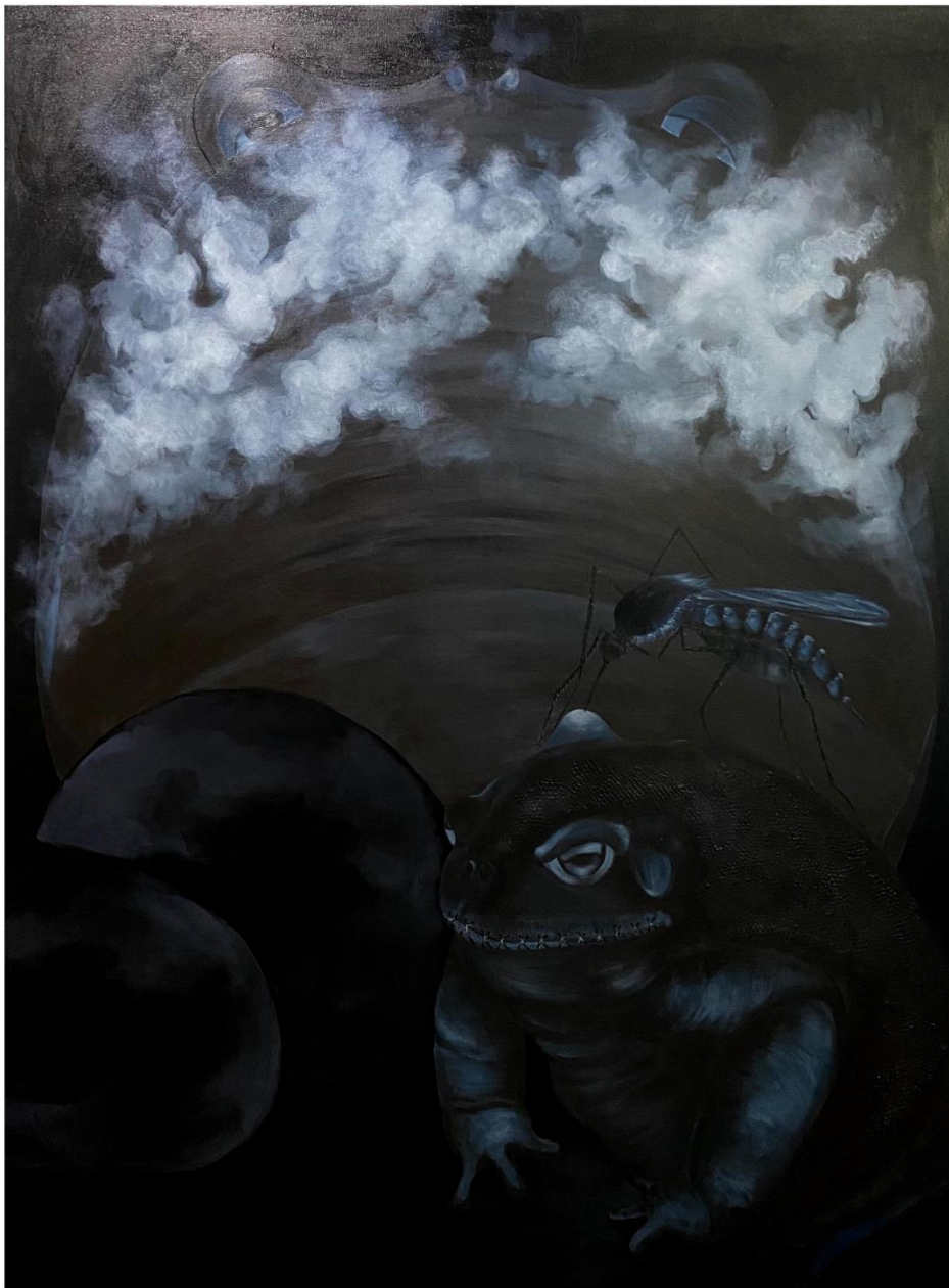
Parasite Acrylic on canvas 120 x 90 cm 2021 RM 2,400.00