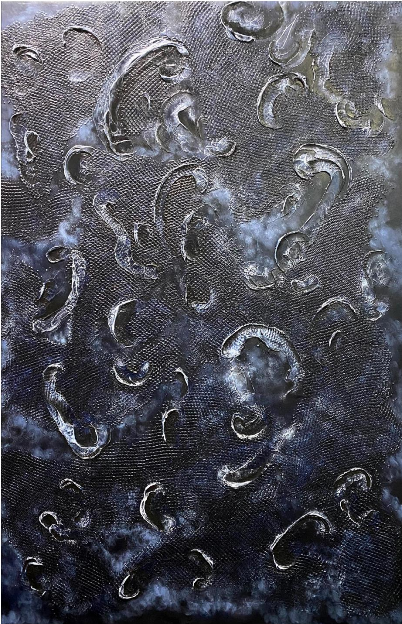
Listening Acrylic on canvas 90 x 60 cm 2021 RM 1,200.00