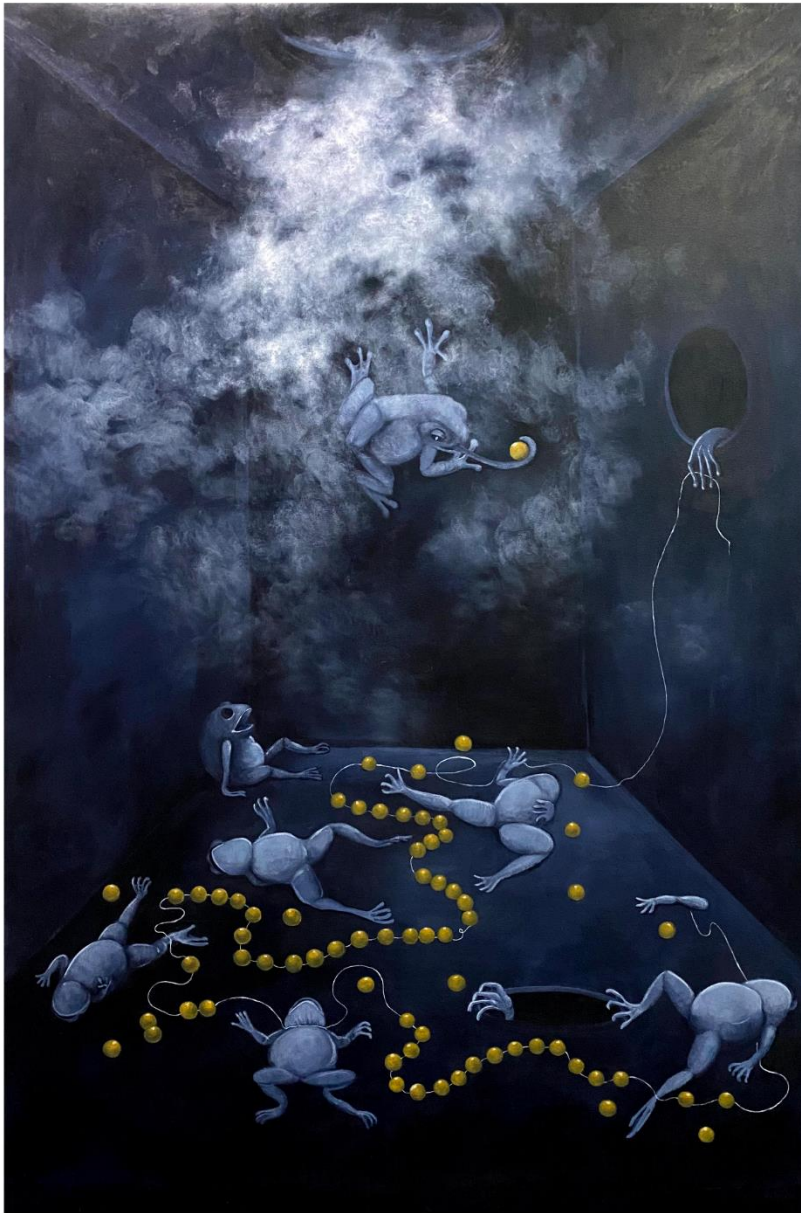
Backroom Acrylic on canvas 90 x 60 cm 2021 RM 1,200.00