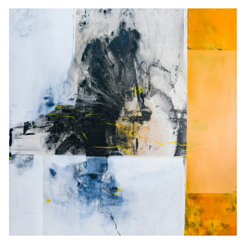
Gersang ii Oil on canvas | 152 x 152 cm | 2022 | MYR 8,750.00