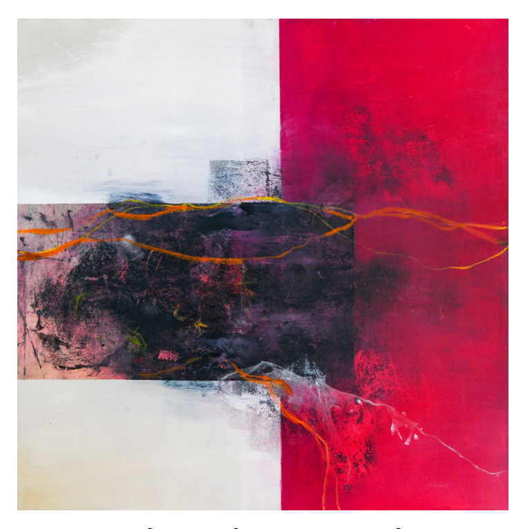
Di Ranting Mawar i Oil on canvas | 76 x 76cm | 2022 | MYR 2,370.00