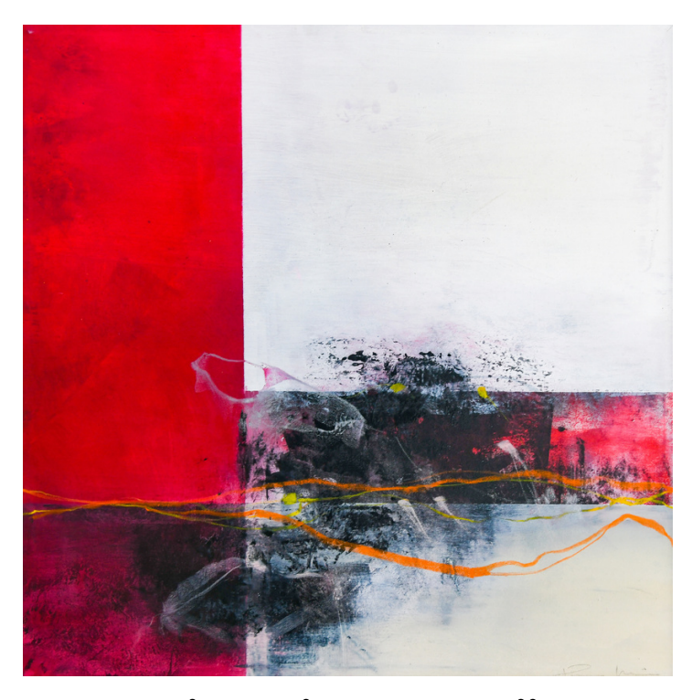
Di Ranting Mawar ii Oil on canvas | 76 x 76cm | 2022 | MYR 2,370.00