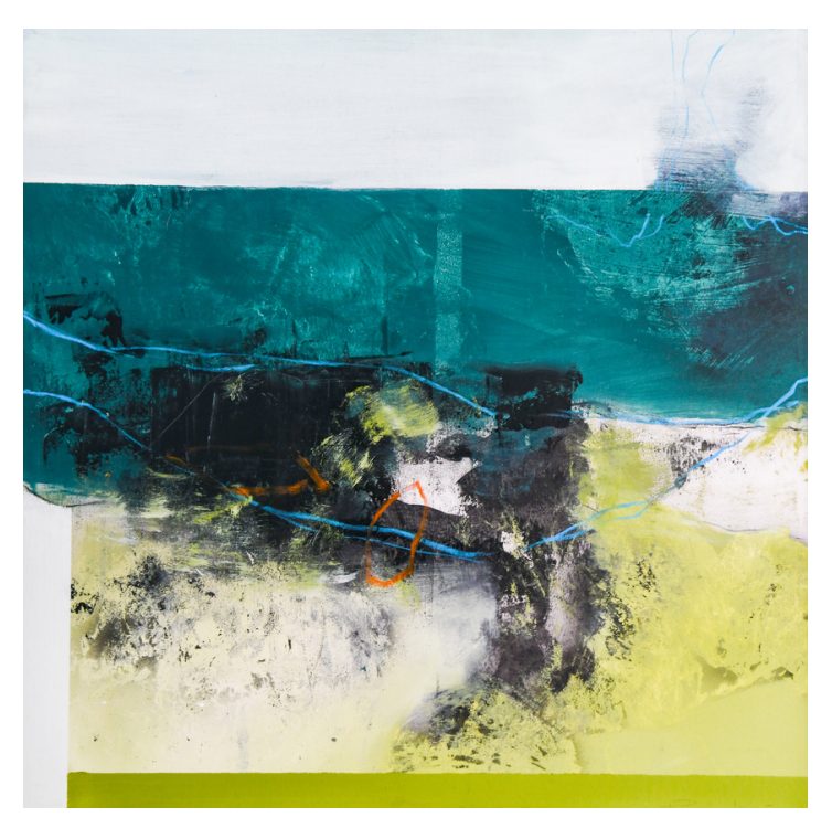
Suatu Sore ii Oil on canvas | 76 x 76cm | 2022 | MYR 2,370.00