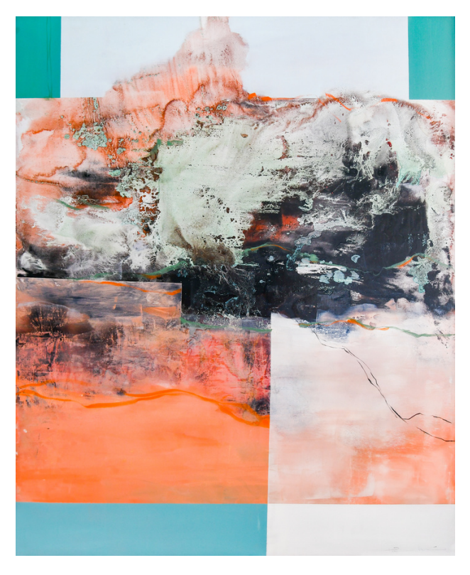
Gersang i Oil on canvas | 152 x 122 cm | 2022 | MYR 6,900.00