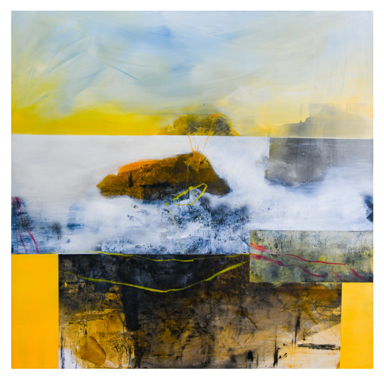
Menanti Mentari Oil on canvas | 137 x 137 cm | 2022 | MYR7,000.00