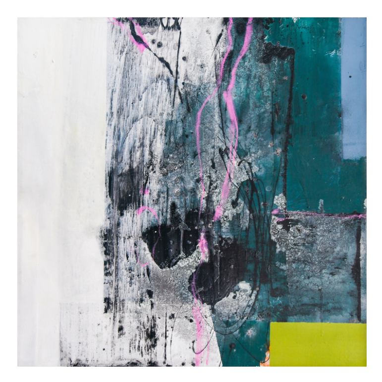
Angin Lalu Oil on canvas | 76 x 76cm | 2022 | MYR 2,370.00