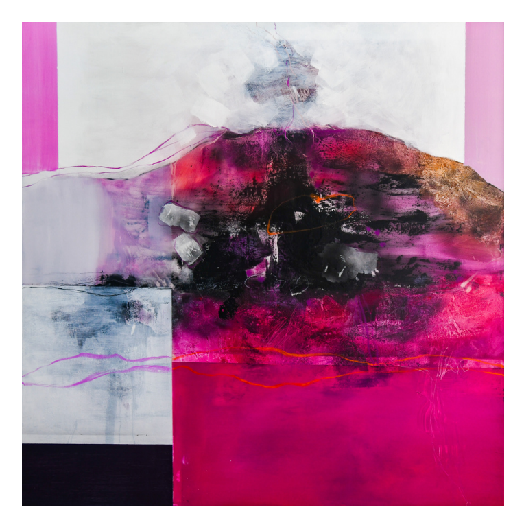
Taman-Taman Lavender Oil on canvas | 137 x 137 cm | 2022 | MYR 7,000.00