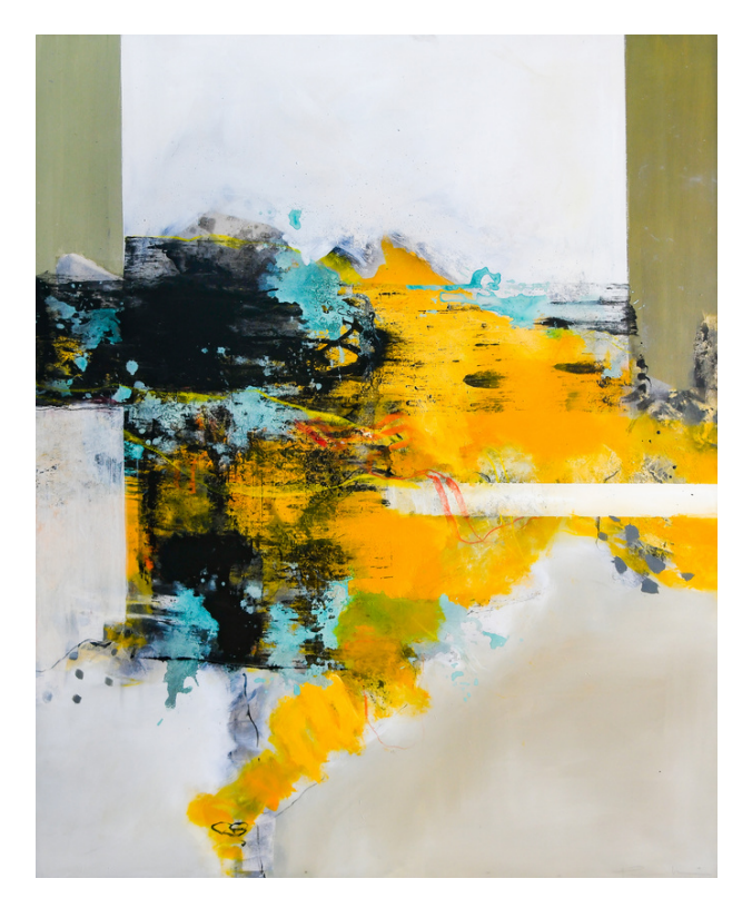
Di Balik Cerun Bukit Oil on canvas | 152 x 122 cm | 2022 | MYR 6,900.00