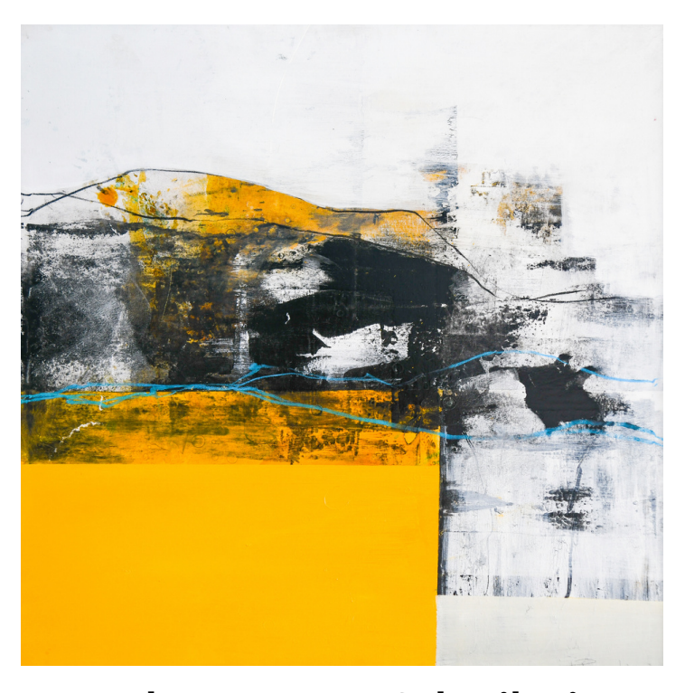
Adapun Panas Seketika i Oil on canvas | 76 x 76cm | 2022 | MYR 2,370.00