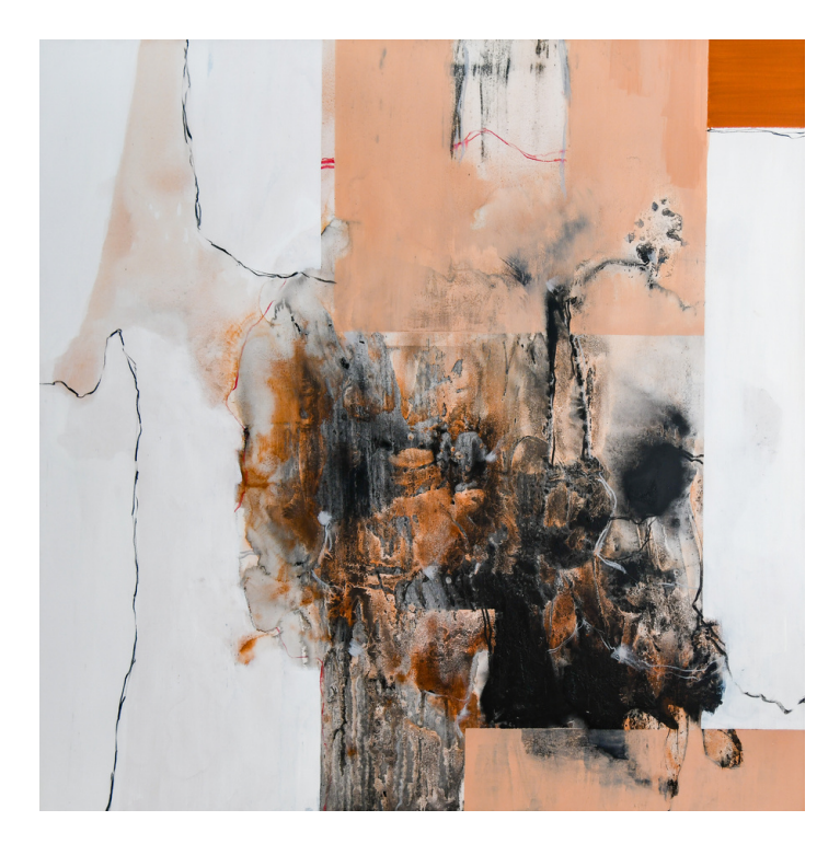
Dilanda 'Bah..' Oil on canvas | 137 x 137 cm | 2022 | MYR 7,000.00