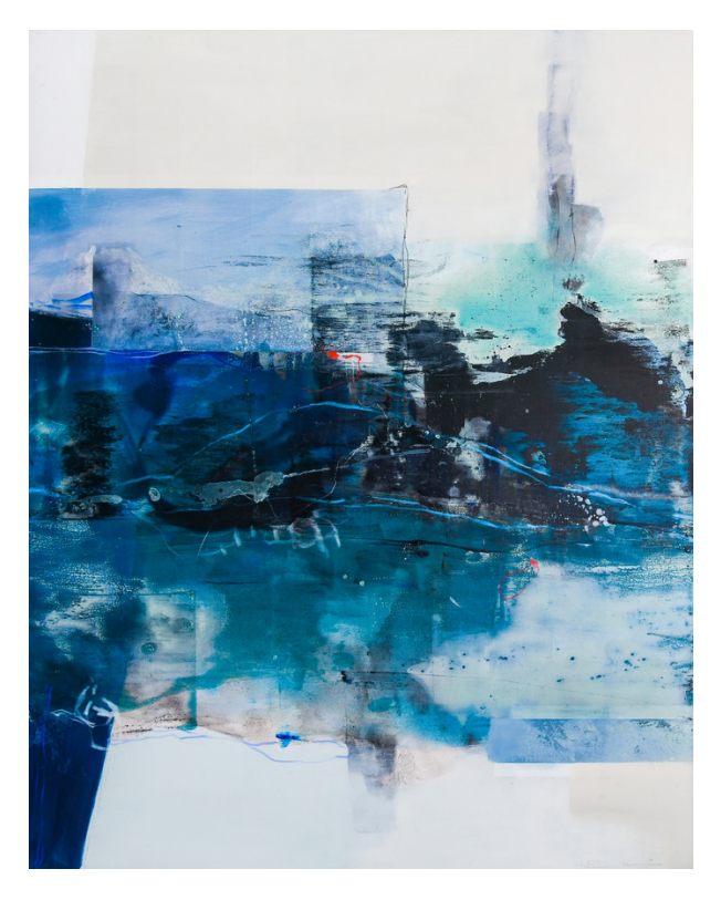
Laut Dalam Oil on canvas | 152 x 122 cm | 2022 | MYR 6,900.00