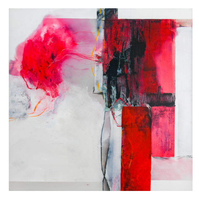
Gerhana ii Oil on canvas | 137 x 137 cm | 2022 | MYR7,000.00