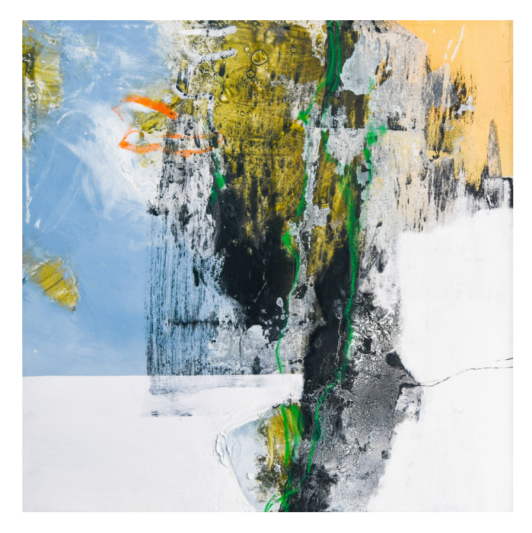
Hentian Simpang Taman Kenanga Oil on canvas | 76 x 76cm | 2022 | MYR 2,370.00