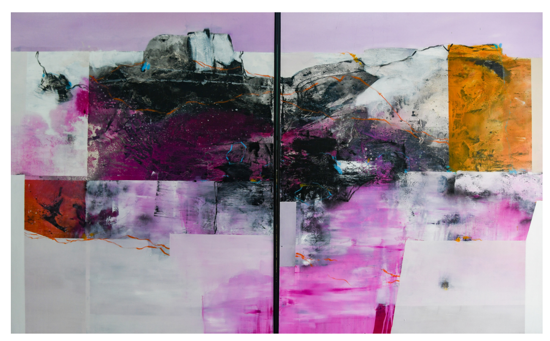
' Sakura..' Oil on canvas | 182 x 304 cm | 2022 | MYR 21,000.00