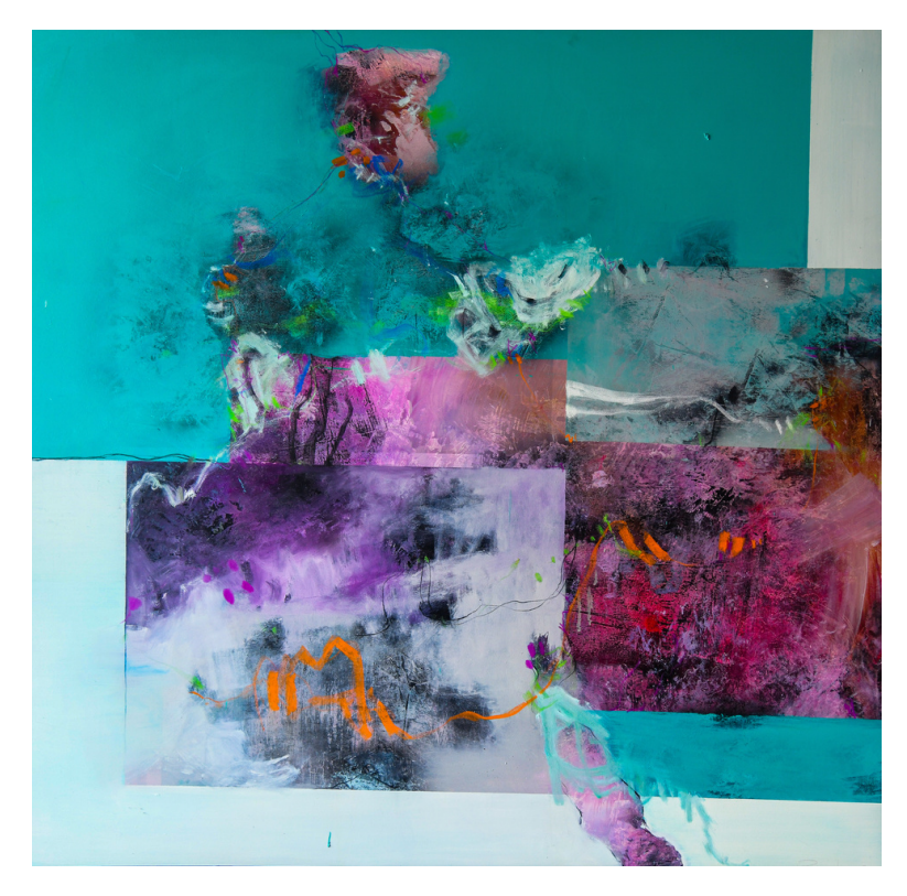
Garis Pagi Oil on canvas | 152 x 152 cm | 2022 | MYR 8,750.00