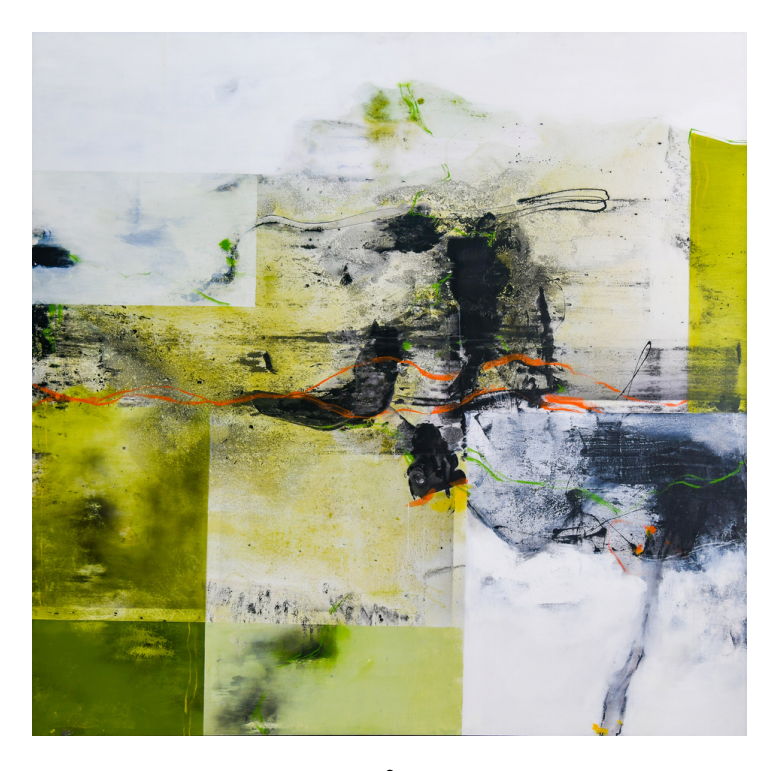
Renjana Oil on canvas | 137 x 137 cm | 2022 | MYR7,000.00