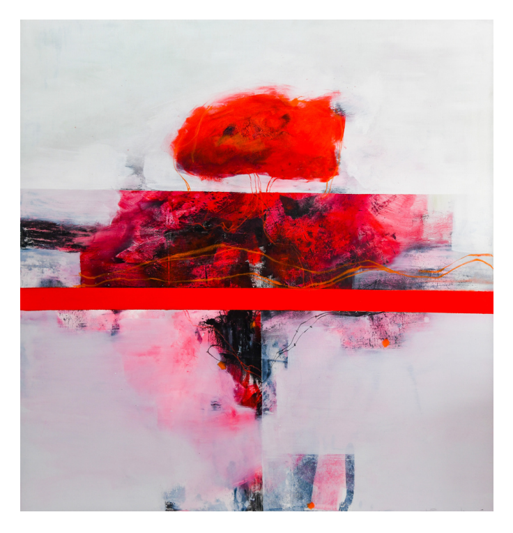
Gerhana i Oil on canvas | 137 x 137 cm | 2022 | MYR 7,000.00