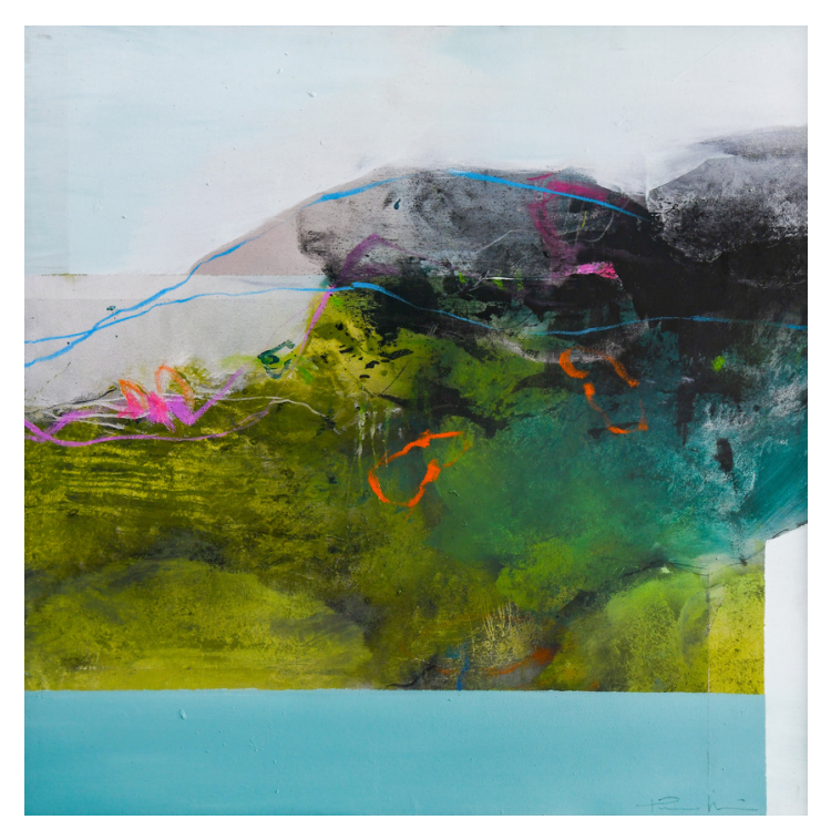
Suatu Sore i Oil on canvas | 76 x 76cm | 2022 | MYR 2,370.00