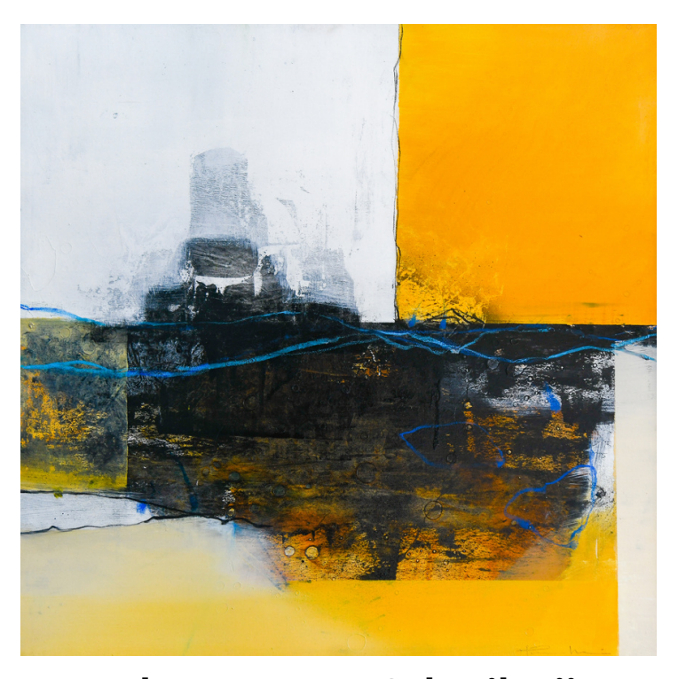
Adapun Panas Seketika ii Oil on canvas | 76 x 76cm | 2022 | MYR 2,370.00